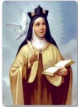
St. Teresa of Avila

St. Teresa experienced towards the end of her life, an inner joy and conviction to have 'lived and died for the church' within the limitation of her Carmelite call but guided and inspired by the Spirit. She understood, lived and experienced the mysteries which perhaps the learned theologians of her time failed to realize and live. Teresian Charism has a wealth of the fidelity and adherence to the Church and her teachings. The Spirit equipped her to understand the supernatural realities as a true bride of Christ.